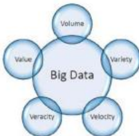
Fig. 1 – Big Data Characteristics [34]

Some of the Vs used to characterize big data include variety, volume, velocity, veracity and value [4]. The different types of data available on a dataset determine variety while the rate at which data is produced determines velocity. Predictably, the size of data is called volume. The two additional characteristics, veracity and value, indicate data reliability and worth with respect to big data exploitation, respectively.